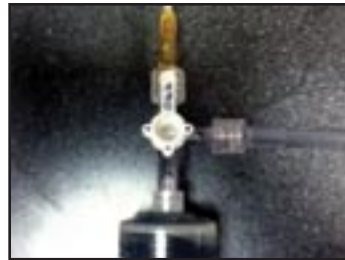
Figure 1: Preparation for insertion of anticoagulant