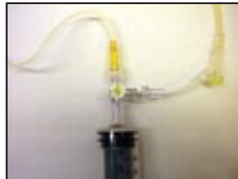
Figure 2: Charging the catheter with anticoagulant