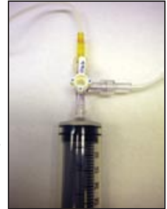
Figure 3: Stopcock positioning for transfer of blood from syringe to bag